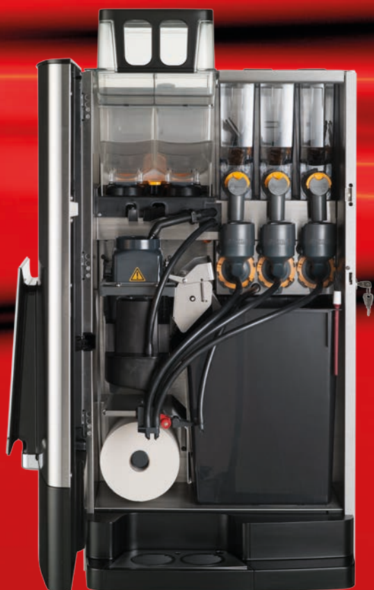
Shown above: FreshGround XL 233 open.