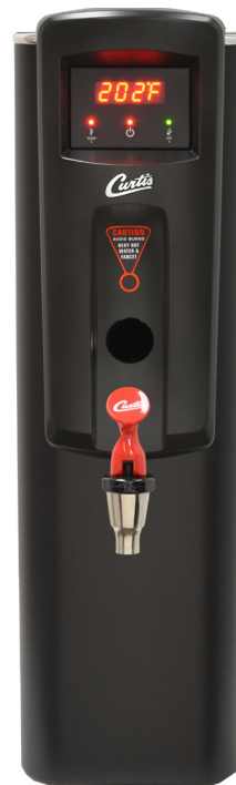
WB5NLB Faucet Height -14.00”