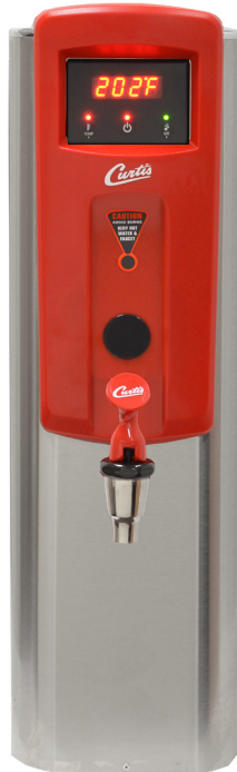
WB5NL Faucet Height -14.00”