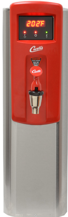
WB5N Faucet Height -18.63”

WB5N – Red Narrow 5.0 Gallon Hot Water Dispenser with Faucet Height of 18.63” WB5NL – Red Narrow 5.0 Gallon Hot Water Dispenser with Faucet Height of 14.00” WB5NB – Black Narrow 5.0 Gallon Hot Water Dispenser with Faucet Height of 18.63” WB5NLB – Black Narrow 5.0 Gallon Hot Water Dispenser with Faucet Height of 14.00”