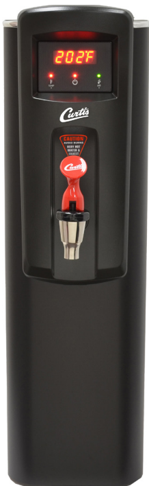
WB5NB Faucet Height -18.63”